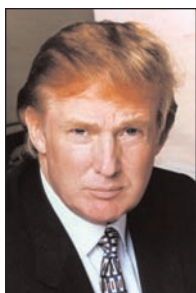
Donald Trump Chairman, President The Trump Organization New York, N.Y.

No name suggests luxury real estate quite like Donald Trump, the first to create a personal luxury brand, associating a face and a name