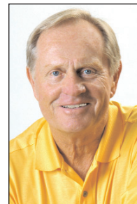
Jack Nicklaus Golfer/Golf Course Designer Nicklaus Design Palm Beach, Fla.

One of the few whose name actually represents a luxury brand, Jack Nicklaus used to symbolize great golf. Now the name stands for great golf courses. In fact, one quarter of the top 100 courses are Nicklaus-designed. Not only did Nicklaus revolutionize course design, but he also sparked a trend in luxury resort real estate. Now, at least one course designed by a big name is de rigueur for resort communities. The bigger the name, the bigger the cachet—but the name Nicklaus is always platinum.