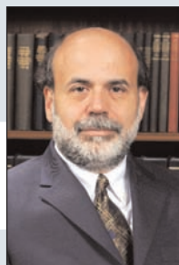
Ben S. Bernanke Chairman The Federal Reserve Washington, D.C.

Few in Washington have as much sway as the chairman of the Federal Reserve. Low interest rates, steady consumer confidence, Wall